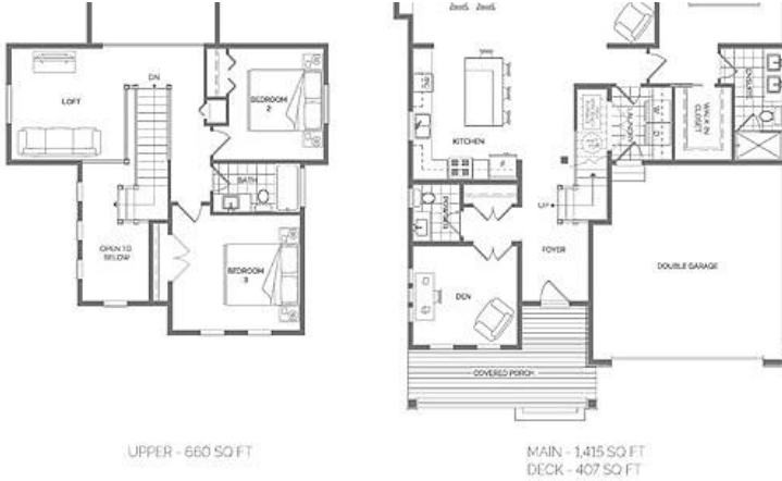
BAYBERRY PLAN | 3 BED + LOFT + DEN | 2.5 BATH | 2,075 SQ FT