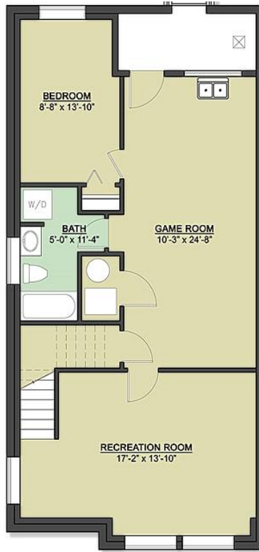
UNIT A - BASEMENT FLOOR LIVING: 932.17 Sq. Ft.