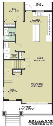
UNIT A - MAIN FLOOR LIVING: 932.17 Sq. Ft.