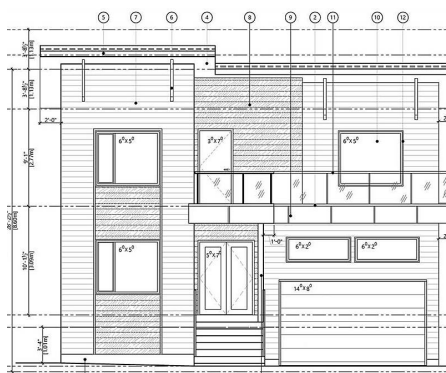
WEST (FRONT) ELEVATION SCALE 1/4"=1'-0"