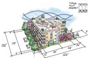
Figure 6.35: 4-Storey 'T' Typology on a 4-Lot Assembly