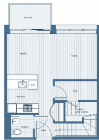
K N Floor 6